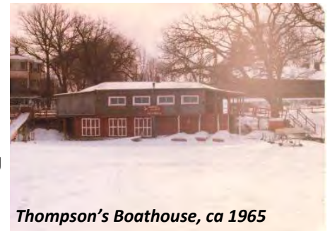
Thompson's Boathouse, ca 1965