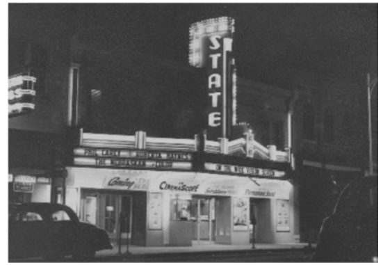
Photo of the State Theater, 1953