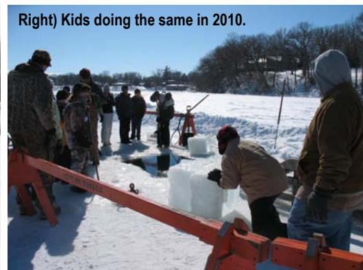
(Right) Kids doing the same in 2010.