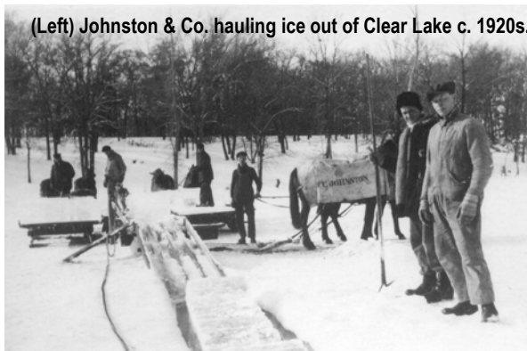
(Left) Johnston & Co. hauling ice out of Clear Lake c. 1920s.