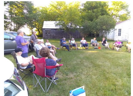
Nice visit with the Waseca Area Garden Club in June.