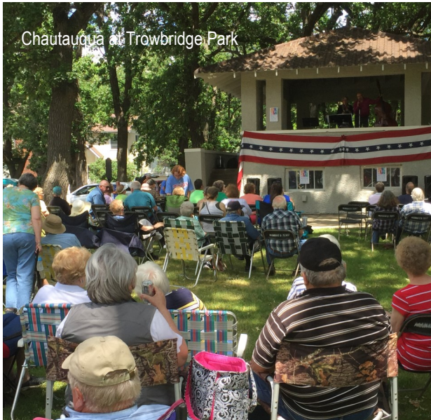
Chautauqua at Trowbridge Park