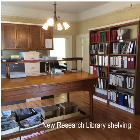
New Research Library shelving