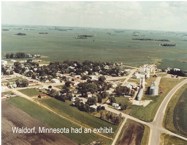
Waldorf, Minnesota had an exhibit.