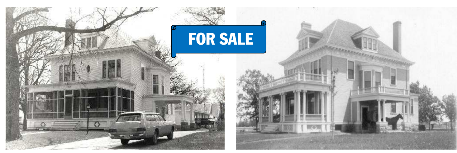
The Leuthold house on Elm Avenue E., as it appeared in 1988, was built by prominent architect Frederick Kees in 1900.

sideration by the Waseca Heritage Preservation Commission (HPC). The recommendation was that it would not qualify on the structure alone. We could try again and include all of Trowbridge Park but the HPC had spent considerable time and grant funding to conduct the evaluation. The missing